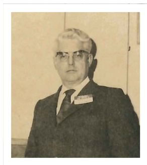
Burton Hall 1949-1967